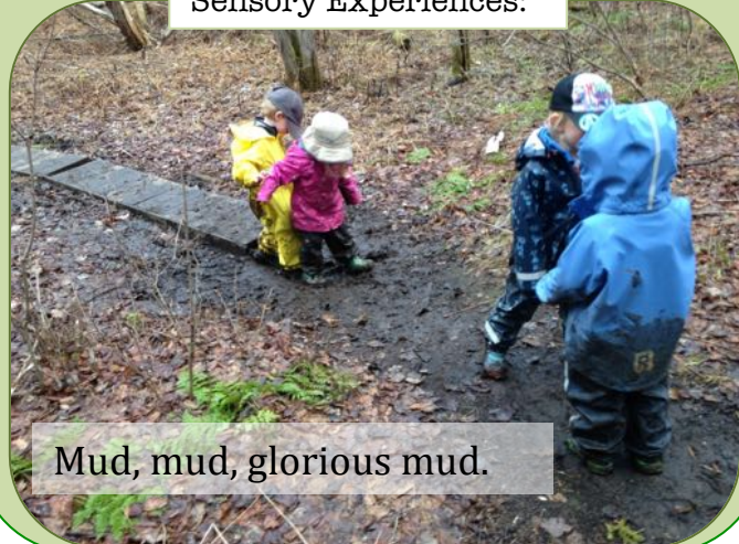
Mud, mud, glorious mud.