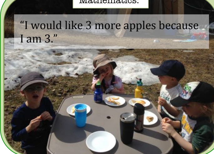
“I would like 3 more apples because I am 3.”