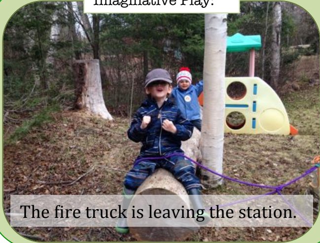
The fire truck is leaving the station.