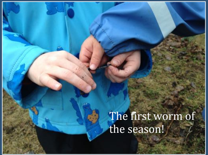
The first worm of the season!