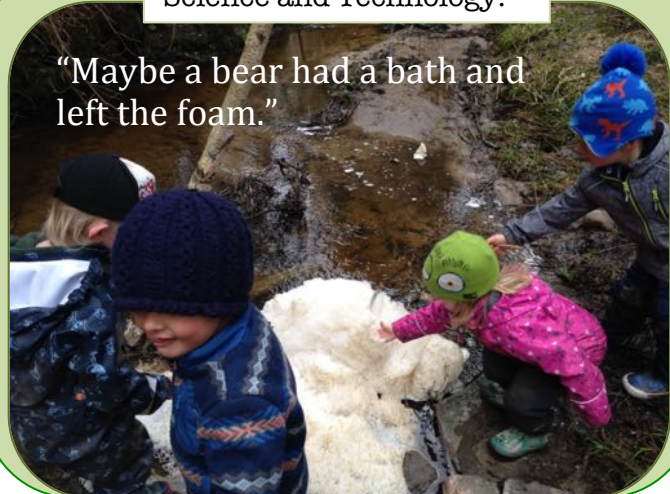
“Maybe a bear had a bath and left the foam.”