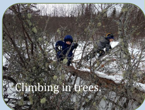
Climbing in trees.