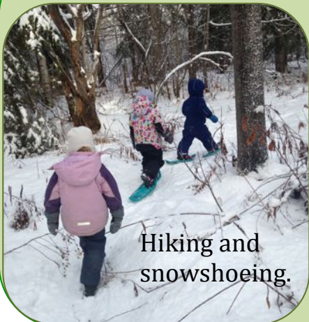
Hiking and snowshoeing.