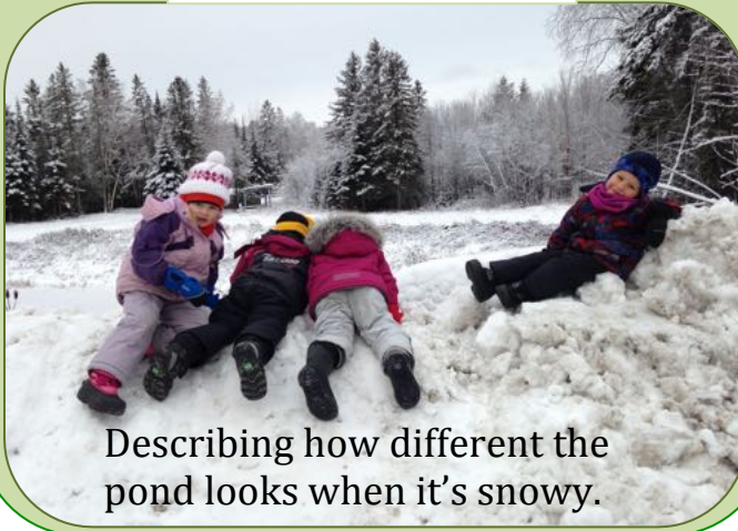
Describing how different the pond looks when it's snowy.