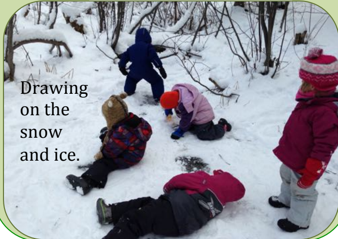
Drawing on the snow and ice.