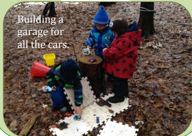
Building a garage for all the cars.