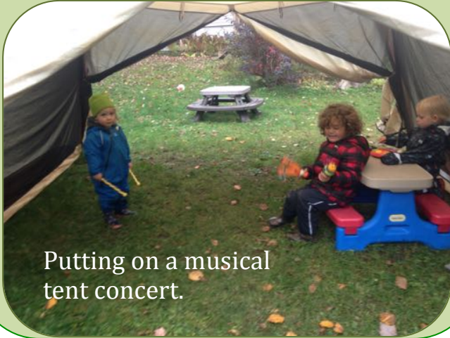
Putting on a musical tent concert.